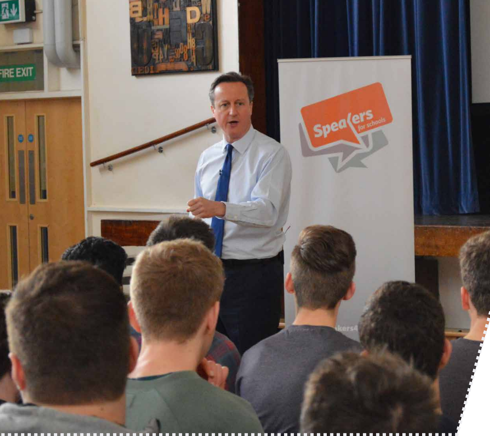
Then Prime Minister David Cameron MP speaks as a part of Speakers for Schools Week 2013